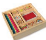
Box of Rubber Stamps