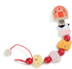
Baby Soother Chain Farm