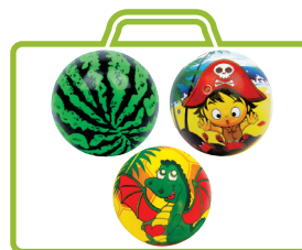
Ball, set of 3