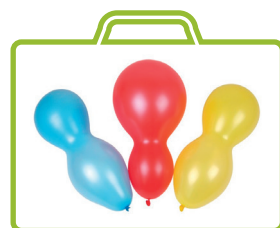
Double balloons, 96 pieces