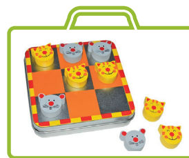
Magnetic Tic Tac Toe