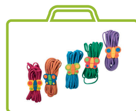
Chinese ropes „Butterflies“